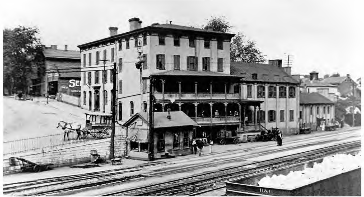
Washington Kroeson built this hotel (left) in 1849. The B&O leased his hotel to replace the station and hotel destroyed in Jackson's 1861 raid. The railroad added the wing on the west side of the hotel to serve as a station (right of the hotel). The B&O bought the hotel in 1866. It has served the B&O and its successors to this day as the Martinsburg passenger station. Some dining car department employees that were not needed on trains running between Martinsburg and Washington used sleeping quarters on the second floor of the station.

lines. It was the largest hotel in the state at the time and had 60 guest rooms on the second and third floors. A dining room on the first floor seated 200 people. The first-floor station was at the east end of the building in the point of the wye. The hotel was officially called "Grafton Hotel" although some references were to "The Grafton" or "Grafton House".