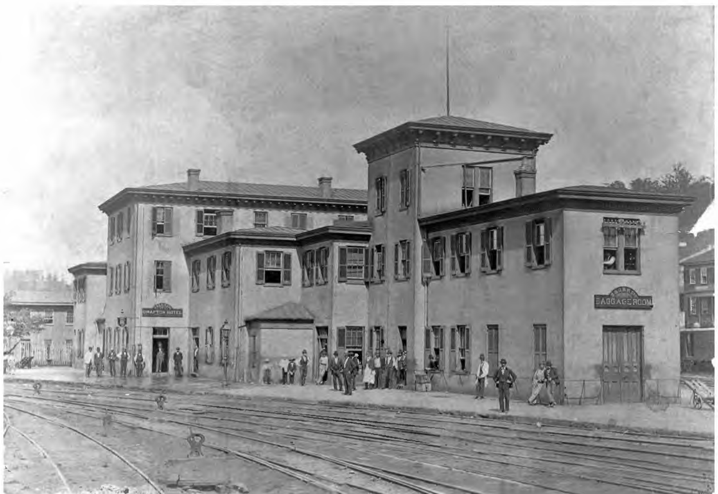
The Grafton Hotel was part of a combination station/hotel built at Grafton, Virginia, by the Northwestern Virginia Railroad, when they constructed the Parkersburg-Grafton line. The B&O bought the station/hotel when it was completed in 1857. The station portion of the building is in the forefront. There was also a large dining room on the first floor and the hotel office.

crews slept on their engines or in rail cars. For this reason, locating a hotel and dining house at Martinsburg made a great deal of sense.