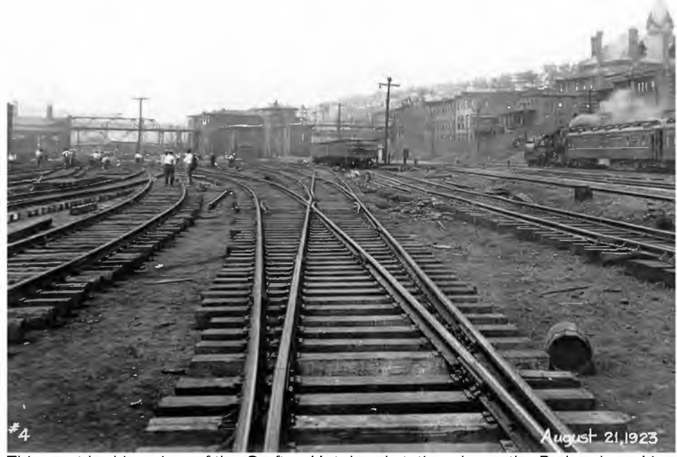
This west-looking view of the Grafton Hotel and station shows the Parkersburg Line passing on the left and the Wheeling line on the right. The 1890 footbridge can be seen crossing in the Wheeling line (in the background).

Anticipating the passenger business that would follow the completion of the rail line, the NVRR built a combined station and hotel in Grafton. Building a hotel in Grafton made sense. The new town was growing rapidly. In 1853, Grafton's population was 153. By 1900, it was 8,260. The Grafton Hotel was the second lodging