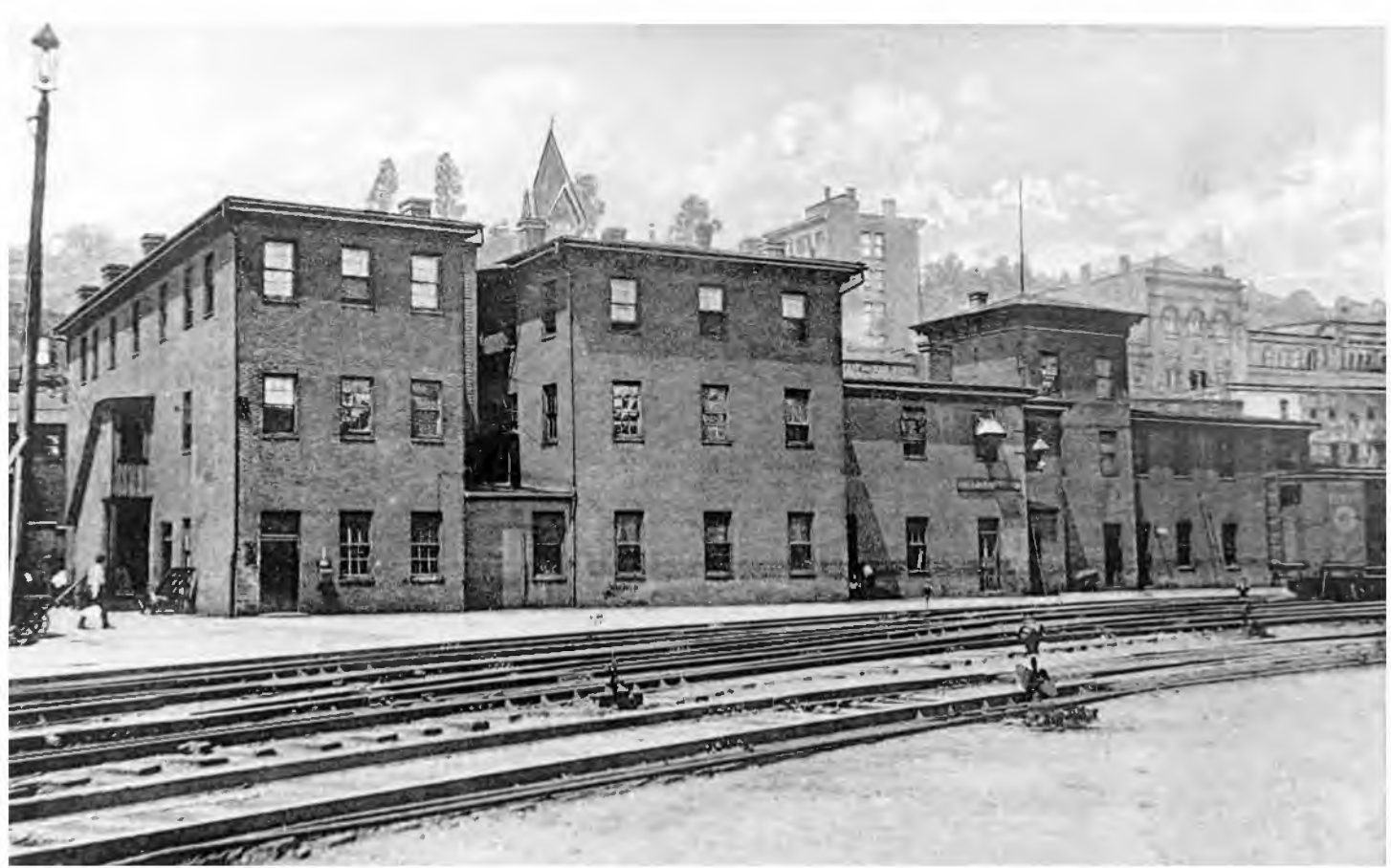
The Grafton Hotel was a rather large facility, being three stories high in some parts. There were 60 guest rooms to serve the traveling public. It continued to operate as a public hotel until the Willard Hotel opened in 1912.

Wheeling. B&O Chief Engineer Latrobe surveyed the route. Construction, funded by the B&O, began in 1851, before the B&O had completed its line to Wheeling.