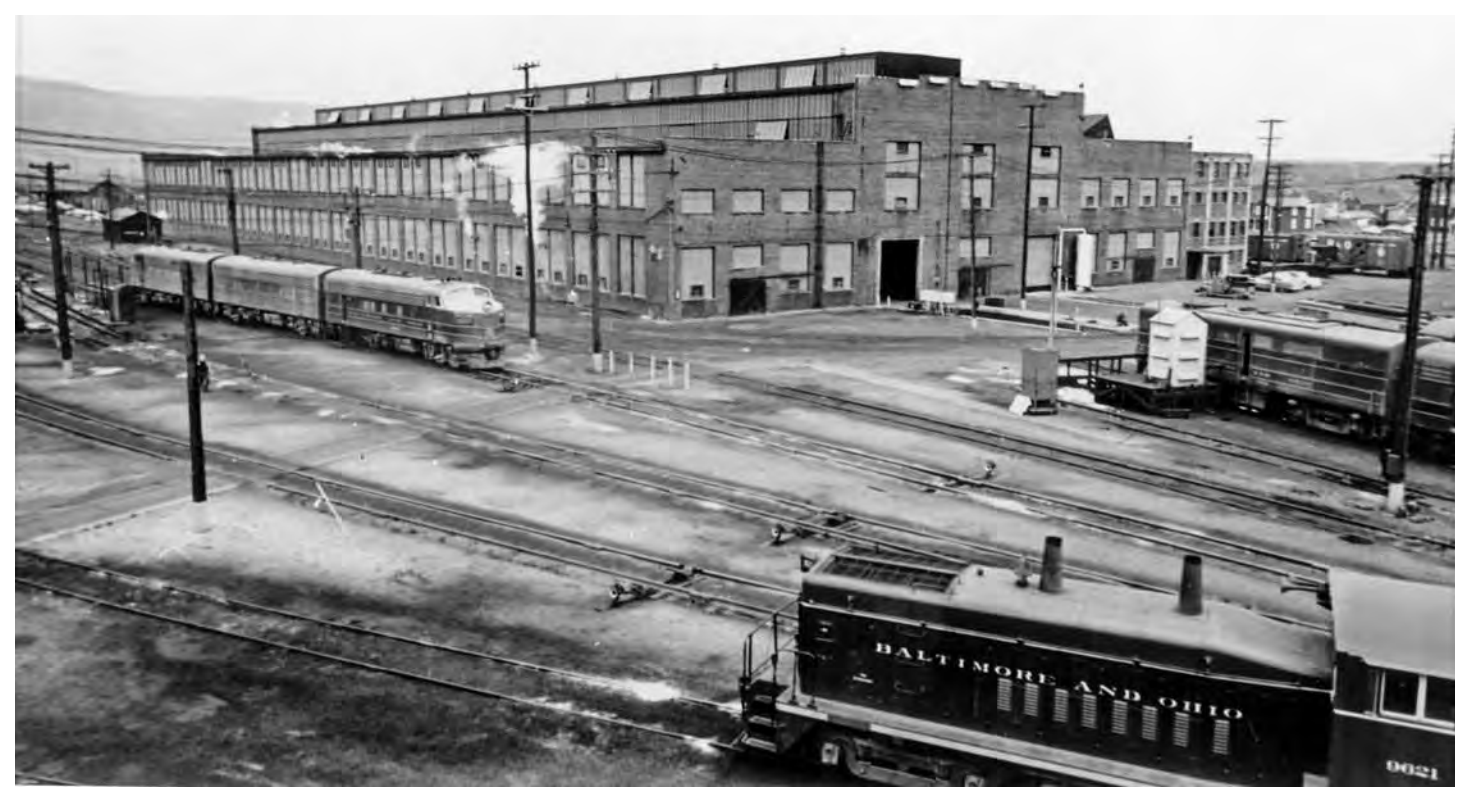
By 1958 the B&O had an up-to-date diesel shop in Cumberland, Maryland, the heart of steam country. As fast as diesels became available, B&O put them in place of steam locomotives.