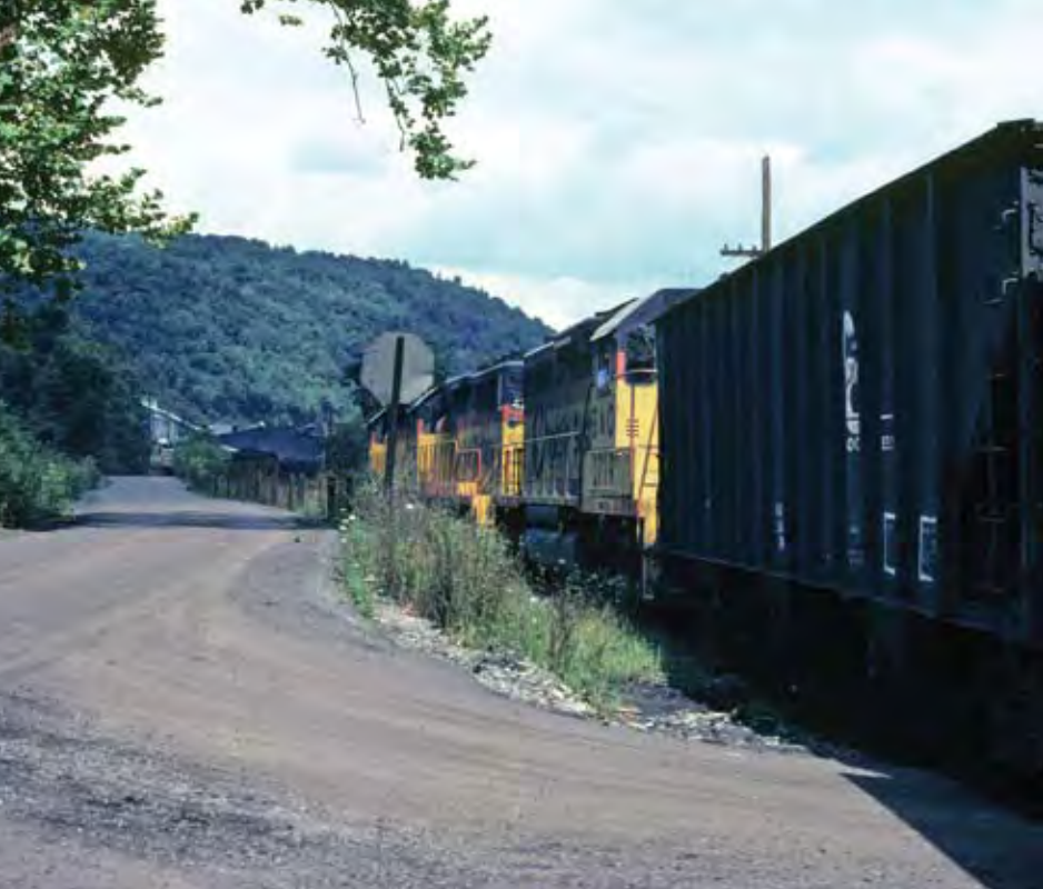
ABOVE: B&O put at least three units on a turn working from M&K Junction the 12.2 miles to Caddell in September 1982.

AT LEFT: Hanging Rock was a scenic feature of the M&K about 12 miles east of Morgantown. The roadbed is now a bike trail.