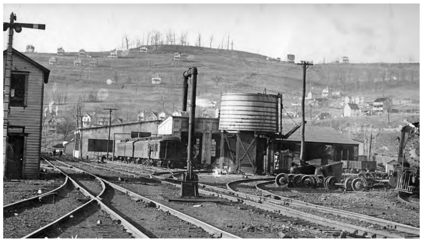
The Morgantown and Kingwood Railroad's shops and only real yard were at Sabraton, West Virginia, just southeast of Morgantown. This photo is dated as taken in 1917; see also the 1918 track chart on page 13. When construction of the M&K began near here in July 1899 the area was known as Sturgiss City. It was renamed in the early 1900s.