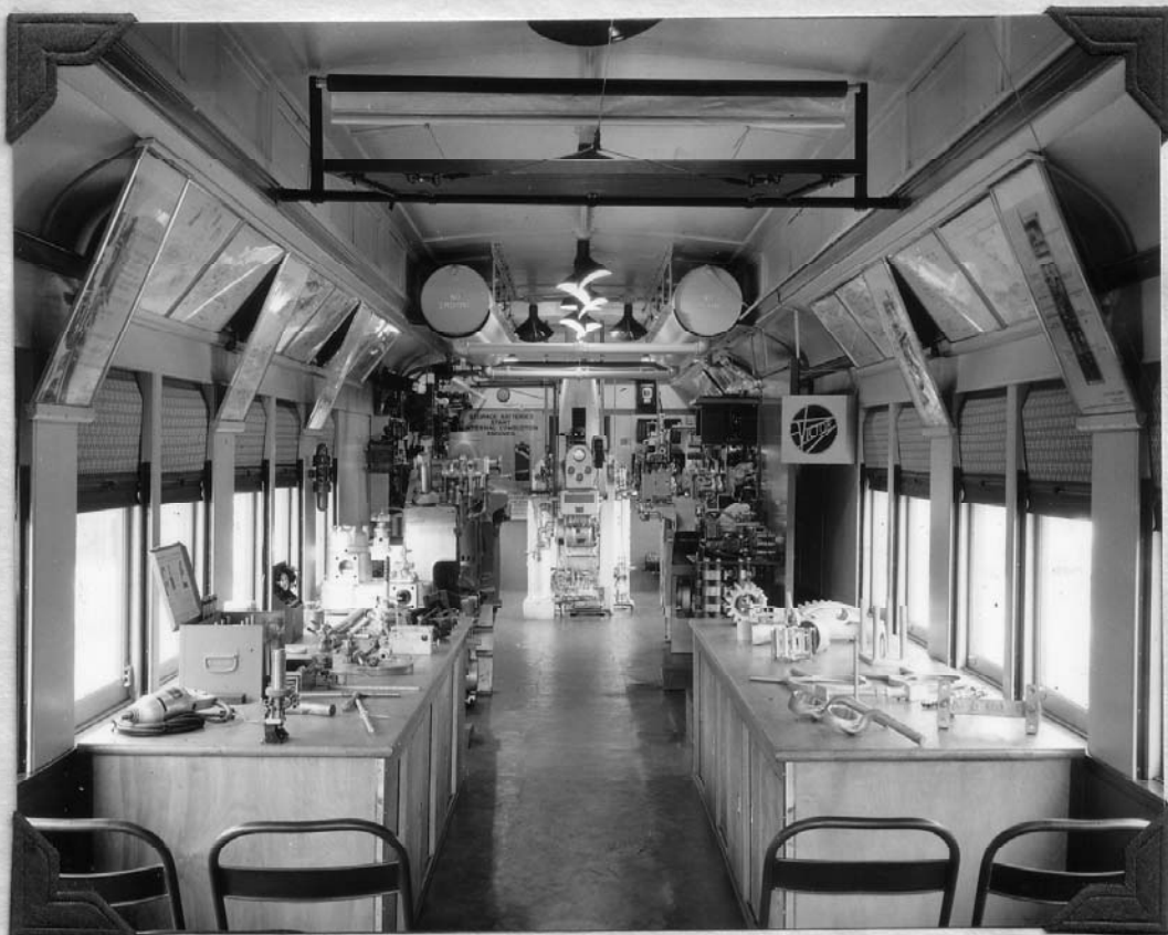
GENERAL VIEW OF THE INTERIOR OF THE CAR FROM THE ENTRANCE SHOWING THE STEAM GENERATOR, ENGINE MODELS, ELECTRICAL CONTROL PANELS, MODEL CABINETS, ETC.