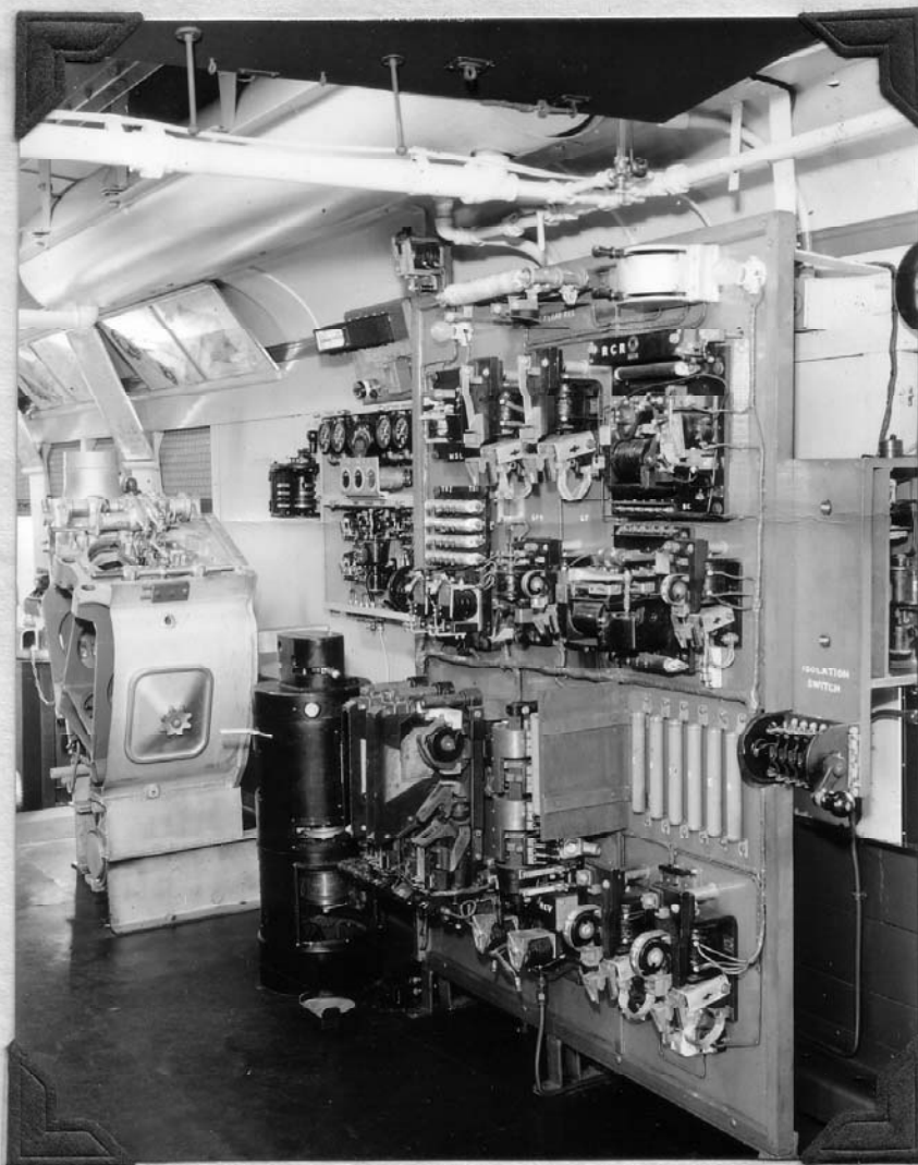
VIEW SHOWING CUT AWAY MODEL OF A 567 TYPE DIESEL ENGINE, ENGINEER'S CONTROLS AND CLASS DP-2 ELECTRICAL CONTROL PANEL