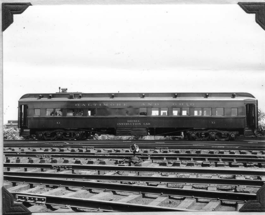
EXTERIOR VIEW OF CAR