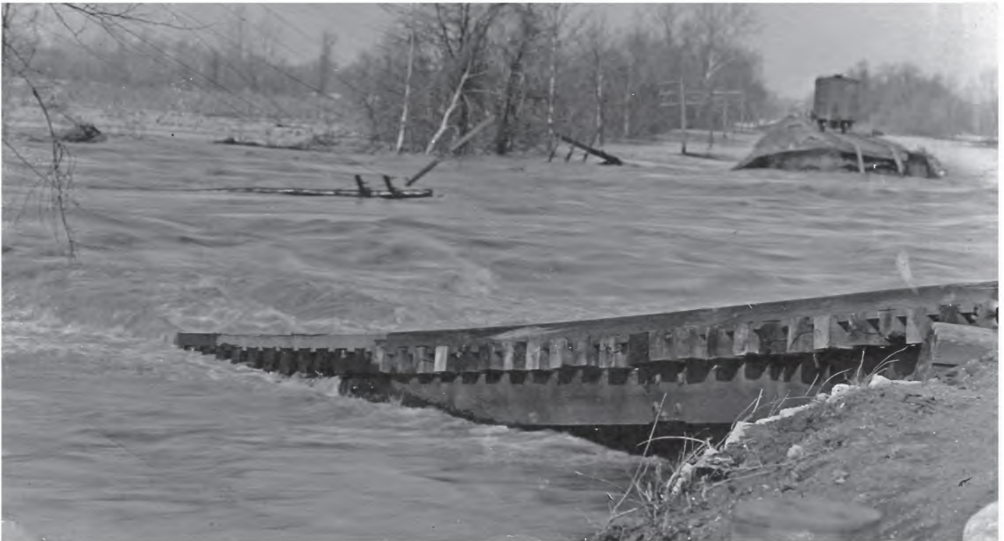
Blue Hole looking west after the accident. The boxcar on the other side is the one many workers were riding in when the portion of the train that was in front of it plunged in to the floodwaters.

along with a work train and a local from the west, were now stranded. Cut off in all directions, there were now 60 or more men on an 18-foot-wide man-made earthen fill approximately 1.3 miles long, completely cut off and surrounded by angry, churning, flood waters, ever rising all the while, threatening to completely wash away the entire embankment. Their situation had become critical.