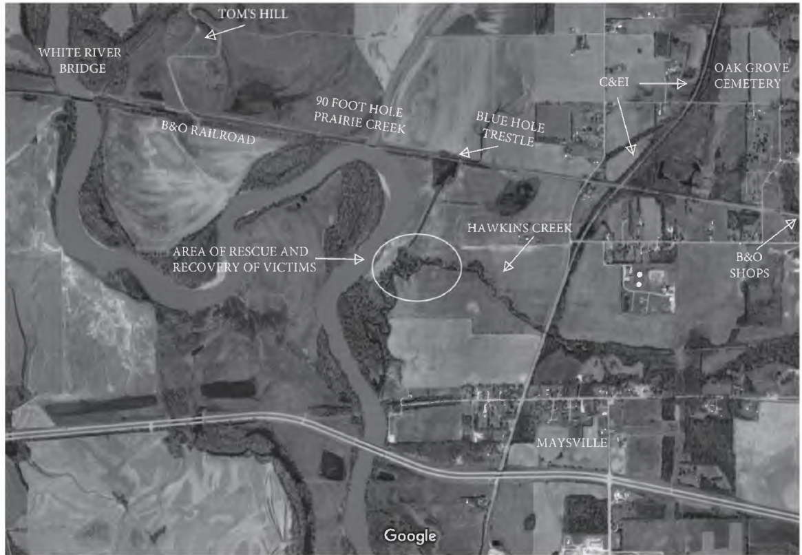
Labeled aerial view of the areas mentioned in this article.

Trainmaster Stevens jumped from the window of the fireman’s side of 401’s cab (downstream side) and was pulled under by the current. Upon finally making it back to the surface, he too found timbers and driftwood swirling among the debris flowing downstream and was also able to use them to stay afloat and grasp a tree top along Hawkins Creek. He and Tucker were able to communicate to one another and together they continued to cry for help. He was rescued by Maysville resident J.D. Sturgeon in a rowboat after nearly three hours in the frigid rushing waters. The flood water is