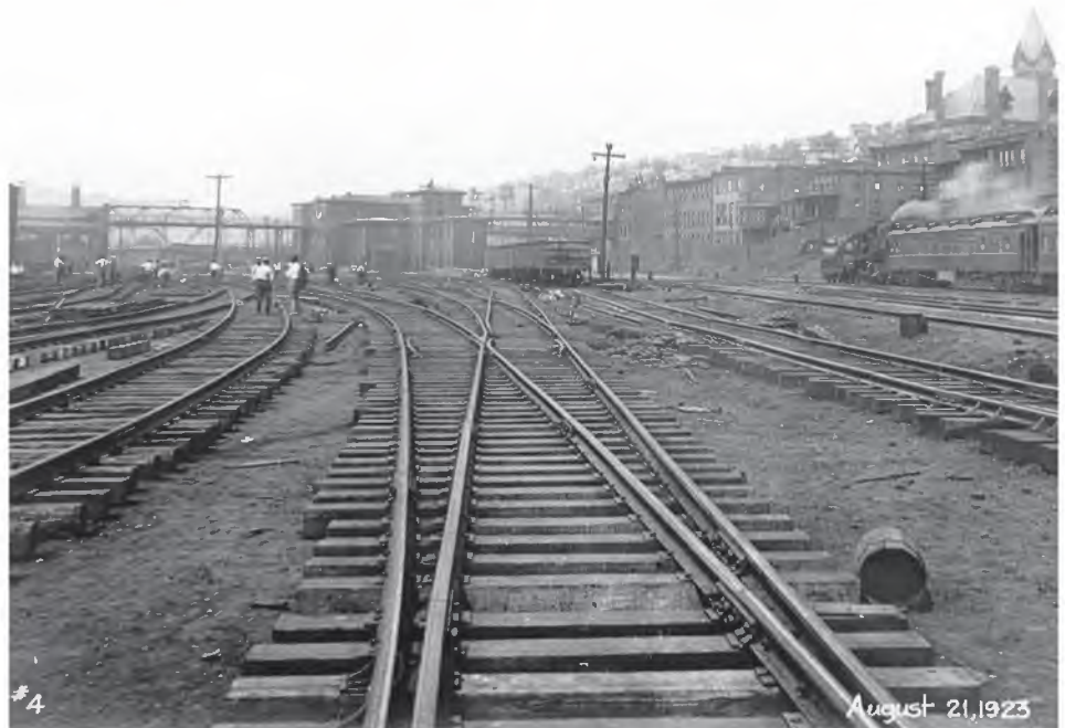
This west-looking view of the Grafton Hotel and station shows the Parkersburg Line passing on the left and the Wheeling line on the right. The 1890 footbridge can be seen crossing in the Wheeling line (in the background).

Anticipating the passenger business that would follow the completion of the rail line, the NVR built a combined station and hotel in Grafton. Building a hotel in Grafton made sense. The new town was growing rapidly. In 1853, Grafton's population was 153. By 1900, it was 8,260. The Grafton Hotel was the second lodging