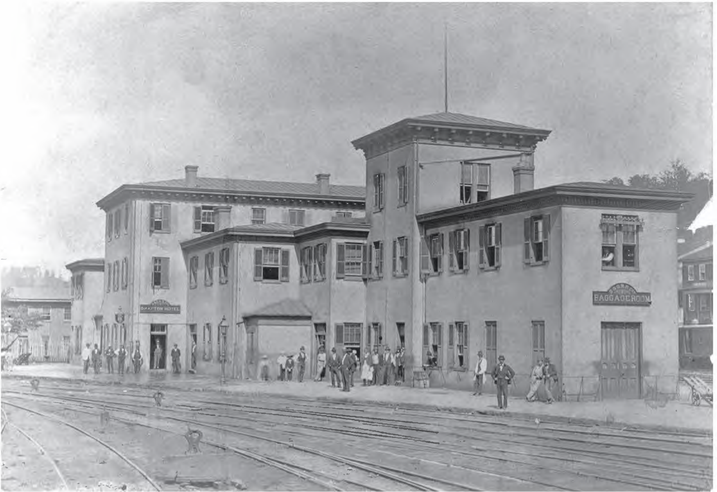
The Grafton Hotel was part of a combination station/hotel built at Grafton, Virginia, by the Northwestern Virginia Railroad, when they constructed the Parkersburg-Grafton line. The B&O bought the station/hotel when it was completed in 1857. The station portion of the building is in the forefront. There was also a large dining room on the first floor and the hotel office.

crews slept on their engines or in rail cars. For this reason, locating a hotel and dining house at Martinsburg made a great deal of sense.