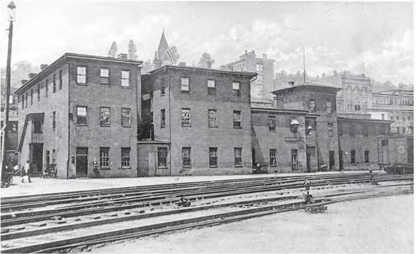
The Grafton Hotel was a rather large facility, being three stories high in some parts. There were 60 guest rooms to serve the traveling public. It continued to operate as a public hotel until the Willard Hotel opened in 1912.

Wheeling. B&O Chief Engineer Latrobe surveyed the route. Construction, funded by the B&O, began in 1851, before the B&O had completed its line to Wheeling.