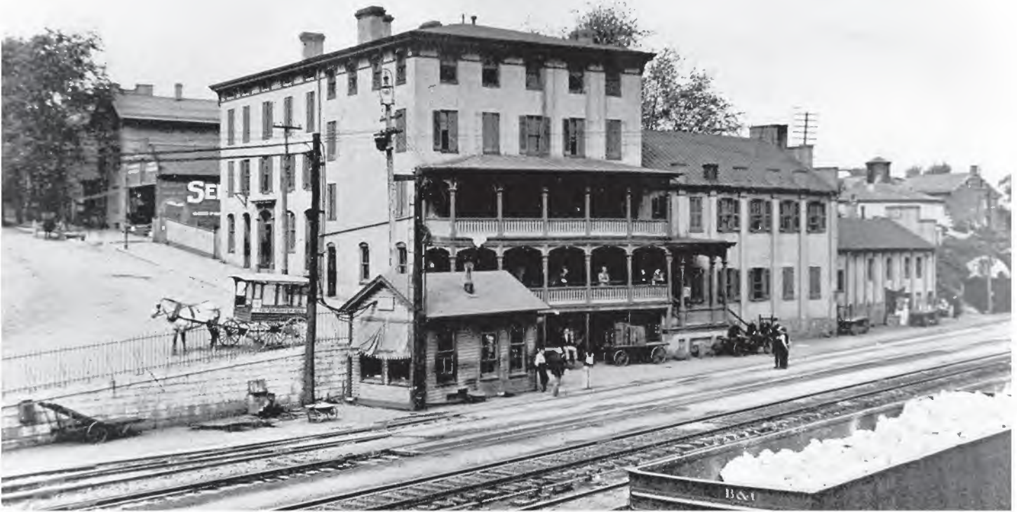
Washington Kroeson built this hotel (left) in 1849. The B&O leased his hotel to replace the station and hotel destroyed in Jackson's 1861 raid. The railroad added the wing on the west side of the hotel to serve as a station (right of the hotel). The B&O bought the hotel in 1866. It has served the B&O and its successors to this day as the Martinsburg passenger station. Some dining car department employees that were not needed on trains running between Martinsburg and Washington used sleeping quarters on the second floor of the station.

lines. It was the largest hotel in the state at the time and had 60 guest rooms on the second and third floors. A dining room on the first floor seated 200 people. The first-floor station was at the east end of the building in the point of the wye. The hotel was officially called "Grafton Hotel" although some references were to "The Grafton" or "Grafton House".