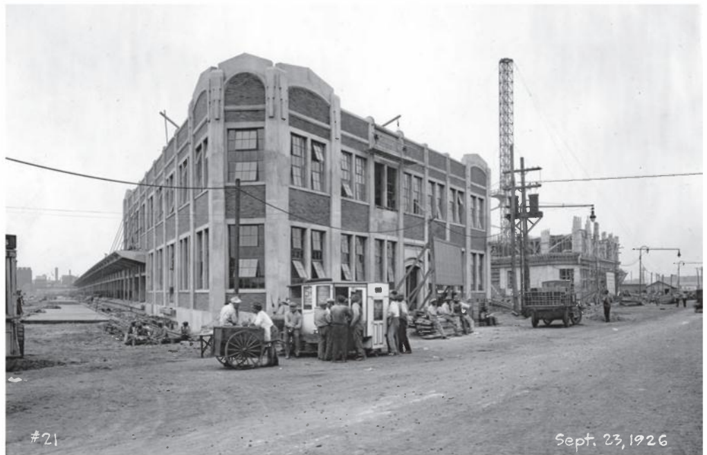
Construction of the Auction Sales Building and the Cold Storage Warehouse, September 23, 1926. The buildings use concrete curtain wall and brick construction. Fish cakes are just 5 cents at the lunch wagon.

Produce from as far as California (e.g., grapes) and Florida (e.g., citrus) would arrive at Eastside Yard and then be switched to the Terminal. Cars would be placed in the Team Delivery Yard early each morning alongside the team delivery sheds. About ten cases of fruit would be removed from each