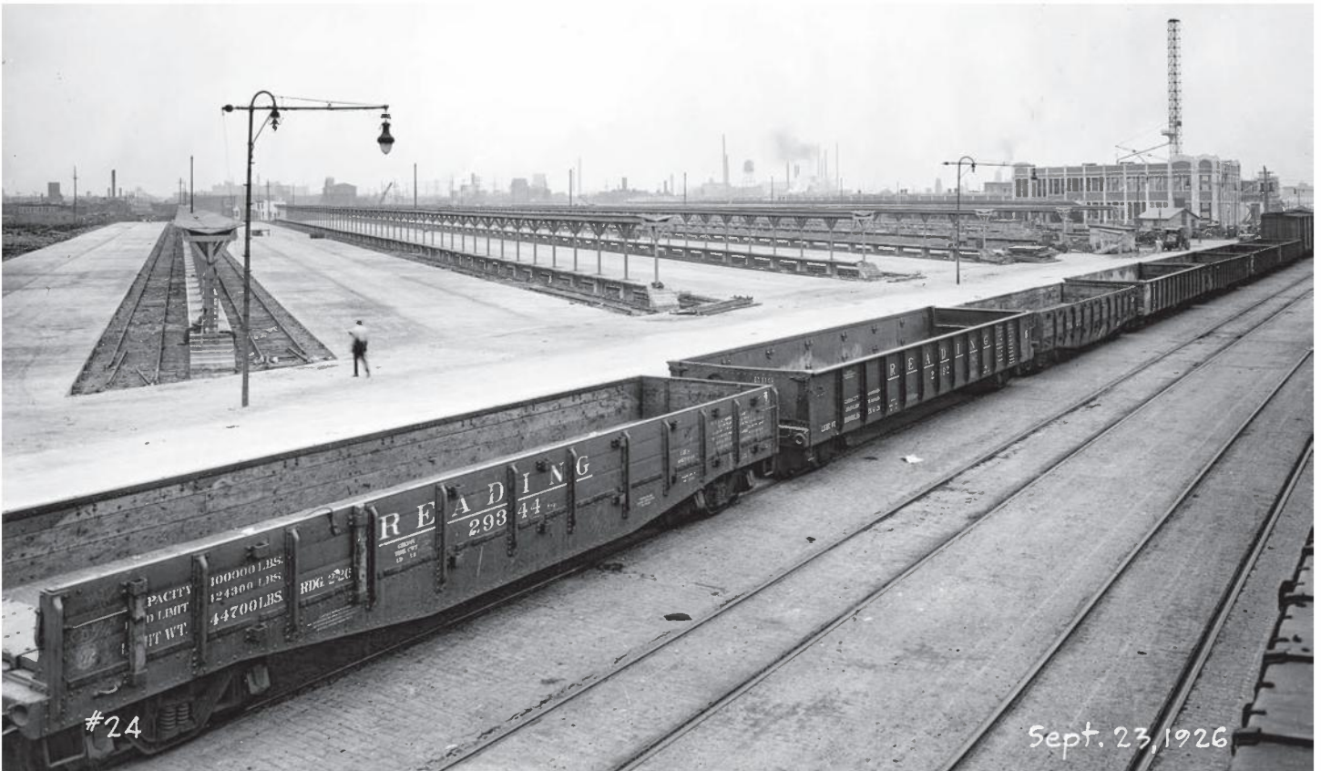
The Team Delivery Yard is nearing completion, September 23, 1926. A string of Reading Company gondolas stands on Delaware Avenue.