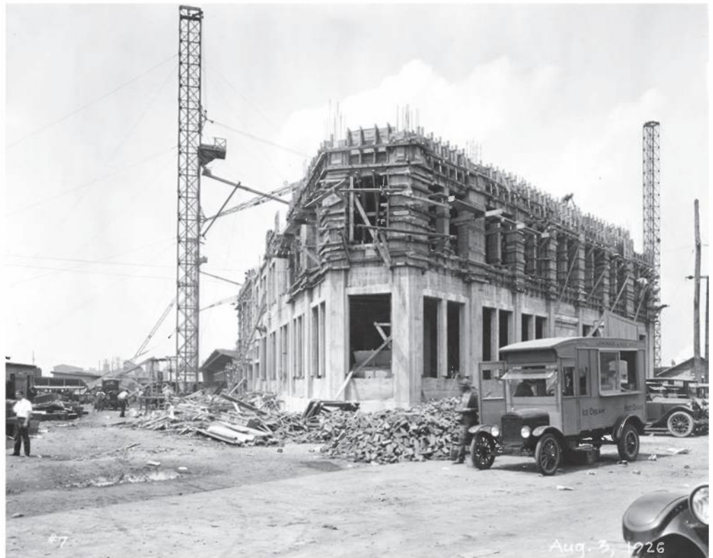
Construction of the Auction Sales Building, looking west from Delaware Avenue, August 3, 1926. The lunch wagon is advertising lemonade, root beer, ice cream, and hot dogs.

The Pennsylvania Railroad quickly responded to competition in their own back yard, completing a large Produce Terminal less than a mile away at a cost of over $6,000,000 in July 1927.