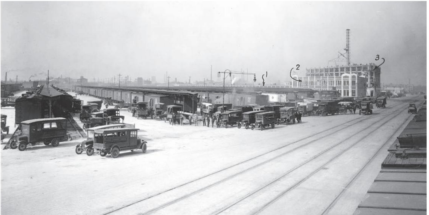
Taken from the top of a box car looking north along Delaware Avenue, the Auction Sales Shed (1) and the Auction Sales Building (2) are in full operation while the Cold Storage Warehouse (3) is still under construction.