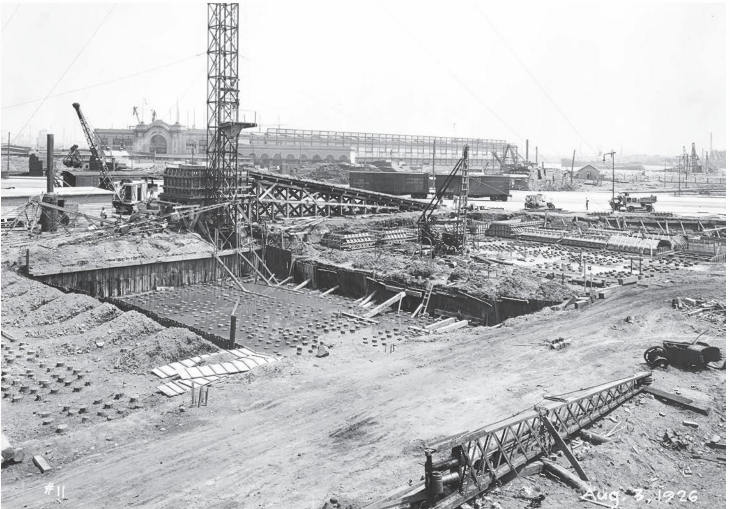
Construction of the Terminal, looking east toward the Delaware River, August 3, 1926. A Pere Marquette automobile and furniture car and a Lehigh Valley box car are on Delaware Avenue. The B&O foreign freight terminal at Pier 78 is in the background. (B&ORHS Archives)

B&O's Pier 11, located just to the south, handled merchandise traffic and fruit overflow from Pier 12; however, Pier 11 was condemned to make way for the new Delaware River Bridge (renamed Benjamin Franklin Bridge in 1955). When bridge construction began in 1922, the B&O remodeled Pier 22 South, its main freight station in Philadelphia, to handle the fruit business.