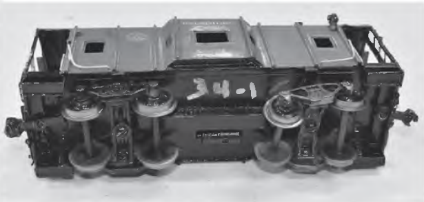
The underside of most of the models at Cincinnati have this type of code number painted on the bottom. Speculation is that the three-digit number identifies the wood transport box with the dash number possibly indicating the position within the box. How else would they be able to efficiently pack up each piece?