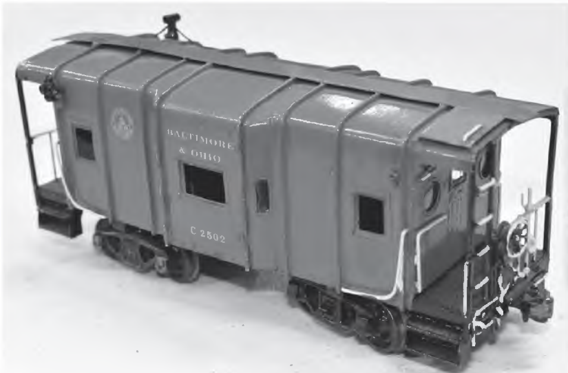
This photo of O-gauge caboose C2502, now painted red and located in the Cincinnati collection, is likely the mystery C2502 noted in the 3Q2023 issue. Just like the prototype, which eventually was painted red, so is the case with this model.