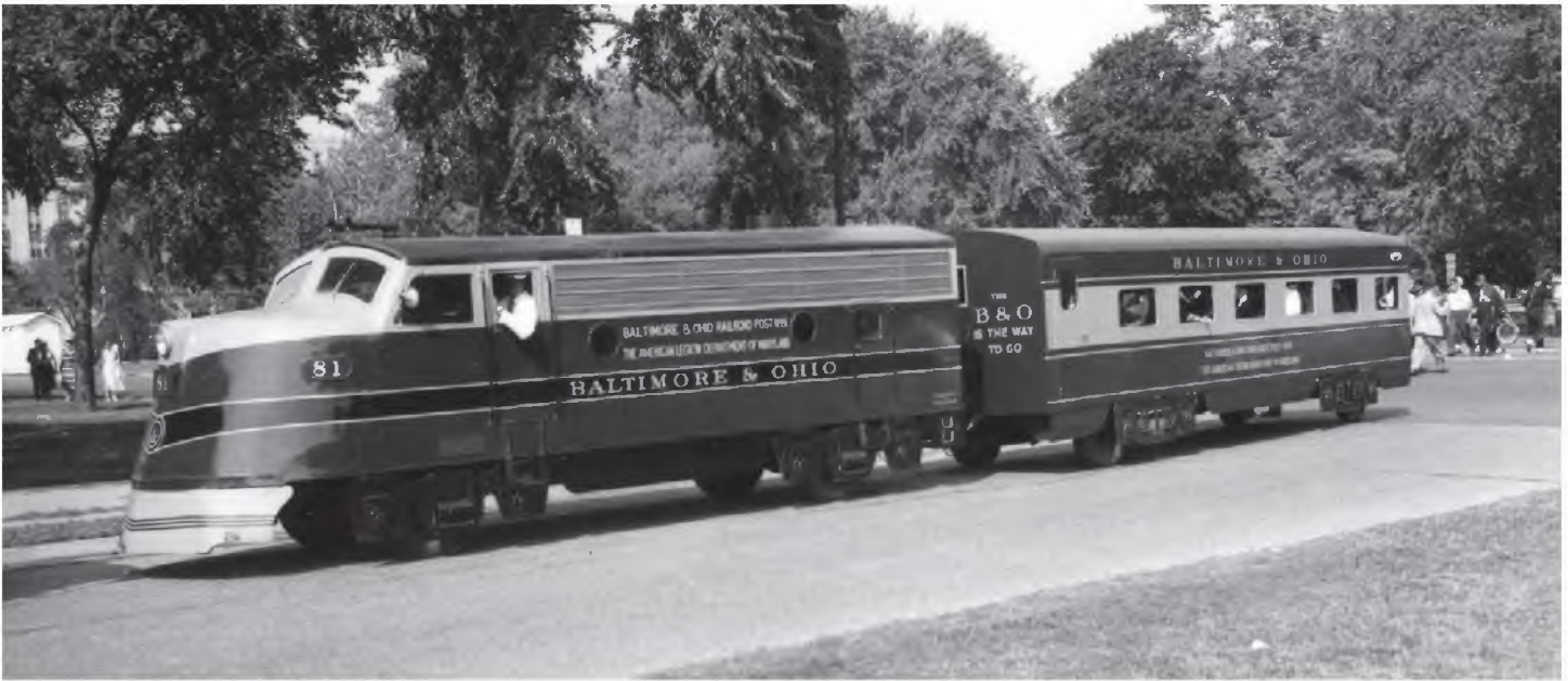
Seldom photographed together, this view shows diesel 81 with its passenger coach in the September 1954 Labor Day Parade at Baltimore.

was also completed to the pilot, and the paint scheme received minor changes.