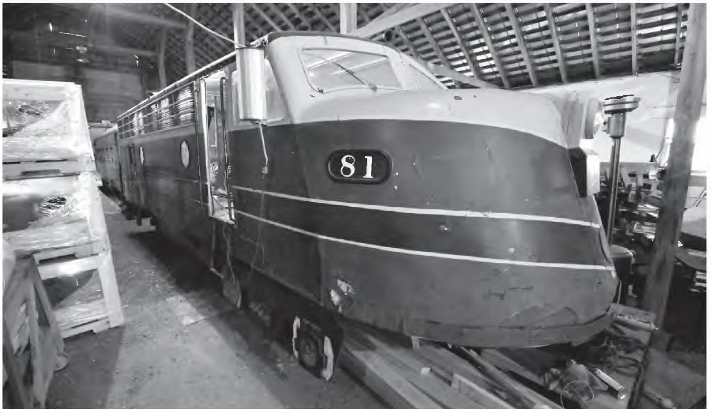
Parade diesel 81 safely stored awaiting restoration by its new owner at Churchville, Maryland, on October 25, 2023.