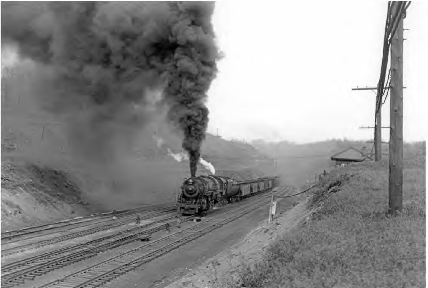
SA Tower just west of Sand Patch Tunnel, almost at the top of the grade.