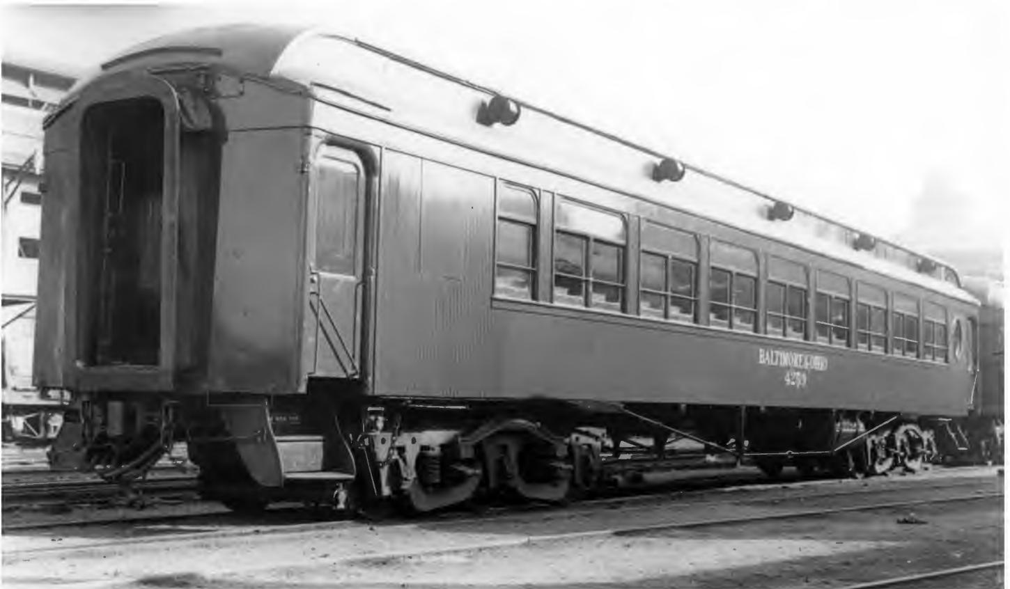
A-14 coach built by AC&F in Wilmington Delaware in 1910. All were retired from revenue service by the 1930s.