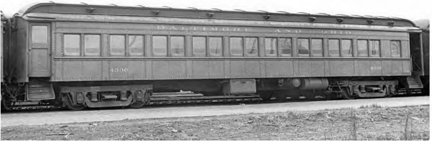
A-16 coach built by AC&F in Wilmington Delaware in 1913.