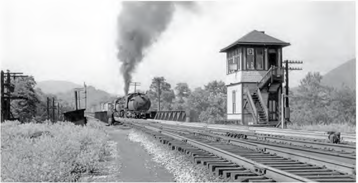
The start of Sand Patch Grade at Q Tower on the east end of Hyndman, Pennsylvania.