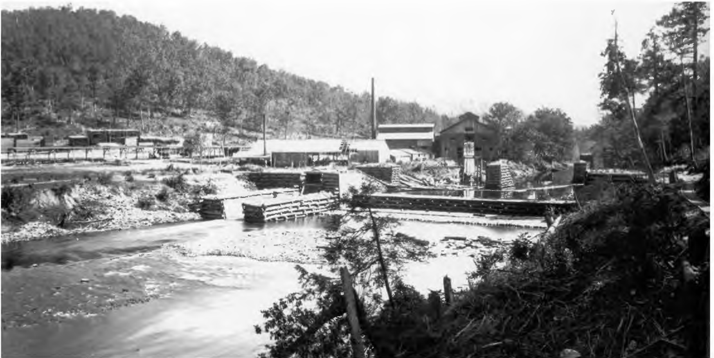
WV&PB&L Co. built a two-band mill at Gauley Mills, West Virginia.