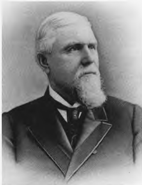
Johnson Newlon Camden 1828-1908.

Johnson Newlon Camden was a significant player in the economic history of West Virginia, or Virginia, which it was named when he started his career. Born in 1828, he attended the U.S. Military Academy at West Point for two years. Camden was admitted to the Virginia bar at age 23. He was involved in every West Virginia petroleum business, except one. Major projects included building an oil refinery at Parkersburg, and founding the First National Bank of Parkersburg. A partnership was formed from his oil interests with John D. Rockefeller's Standard Oil and he became a director of that company. He was a Democratic US Senator, representing West Virginia from 1881-1887 and 1893-1895.