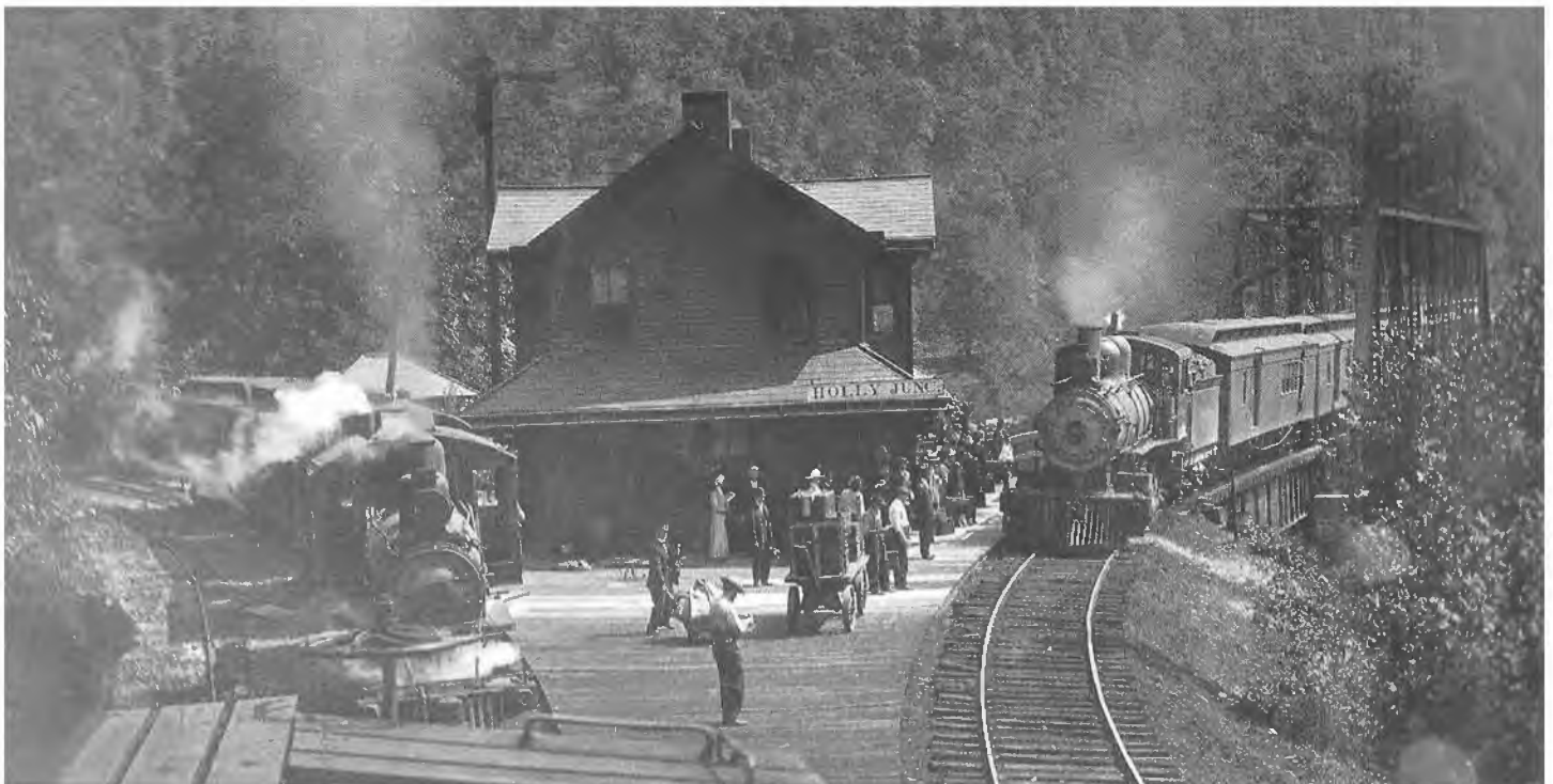
Holly Jct. was the connection between the West Virginia & Pittsburg (later B&O), and the Holly River & Addison Railroad (later the West Virginia Midland). The scheduled arrival of WVM's Sutton Flyer , on the left, met the B&O's train from Richwood headed for Grafton. Today, this area is under the waters of the 1961 man-made Sutton Lake.

and curator of the John W. Barriger III National Railroad library at the University of Missouri in St. Louis, conducted an internet search. He found a Webster County, West Virginia, reference to a measurement station at Camden-on-Gauley in the 1929 book, Magnetic Declination in Delaware, Maryland, Virginia, West Virginia, Kentucky, and Tennessee . The information listing the exact location of the measurement station read, in part, "The station is on the terrace of the hotel of the Baltimore & Ohio Railroad Company on a hill above the railroad station in the southeast part of town." This was independent evidence that there was a B&O hotel in Camden-on-Gauley. It was less certain the B&O's hotel was "The Camden" as there were others in town; however, "The Camden" met the description listed, including that it was on a hill behind the B&O station and had a terrace.