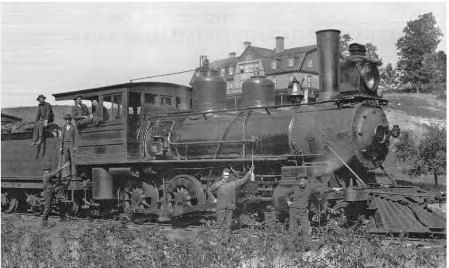
Posed in 1895 in front of The Camden hotel at Camden-On-Gauley is West Virginia & Pittsburgh's 14 (B&O 226).