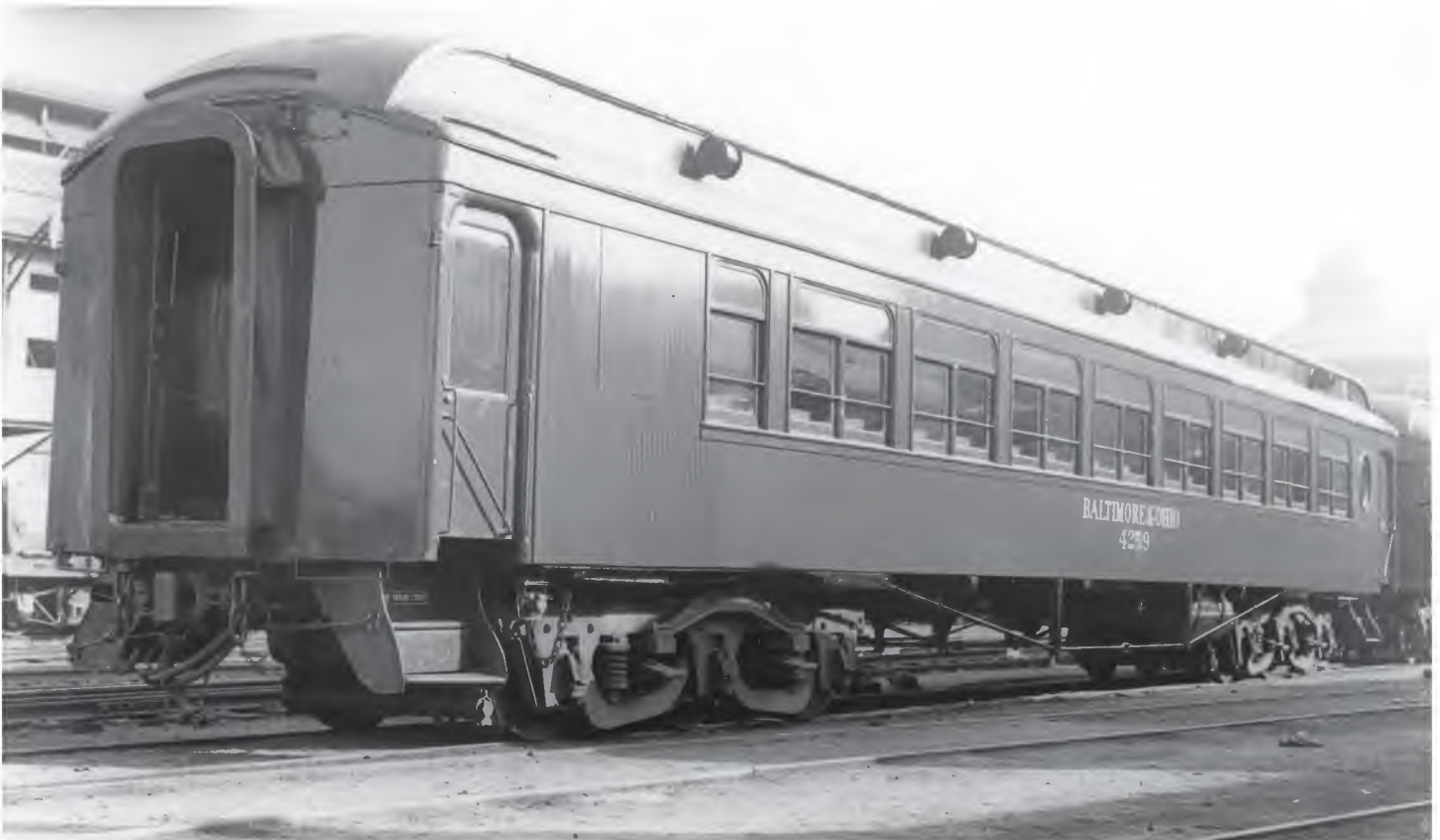
A-14 coach built by AC&F in Wilmington Delaware in 1910. All were retired from revenue service by the 1930s.