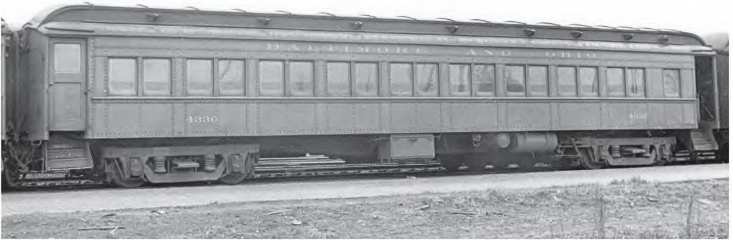
A-16 coach built by AC&F in Wilmington Delaware in 1913.