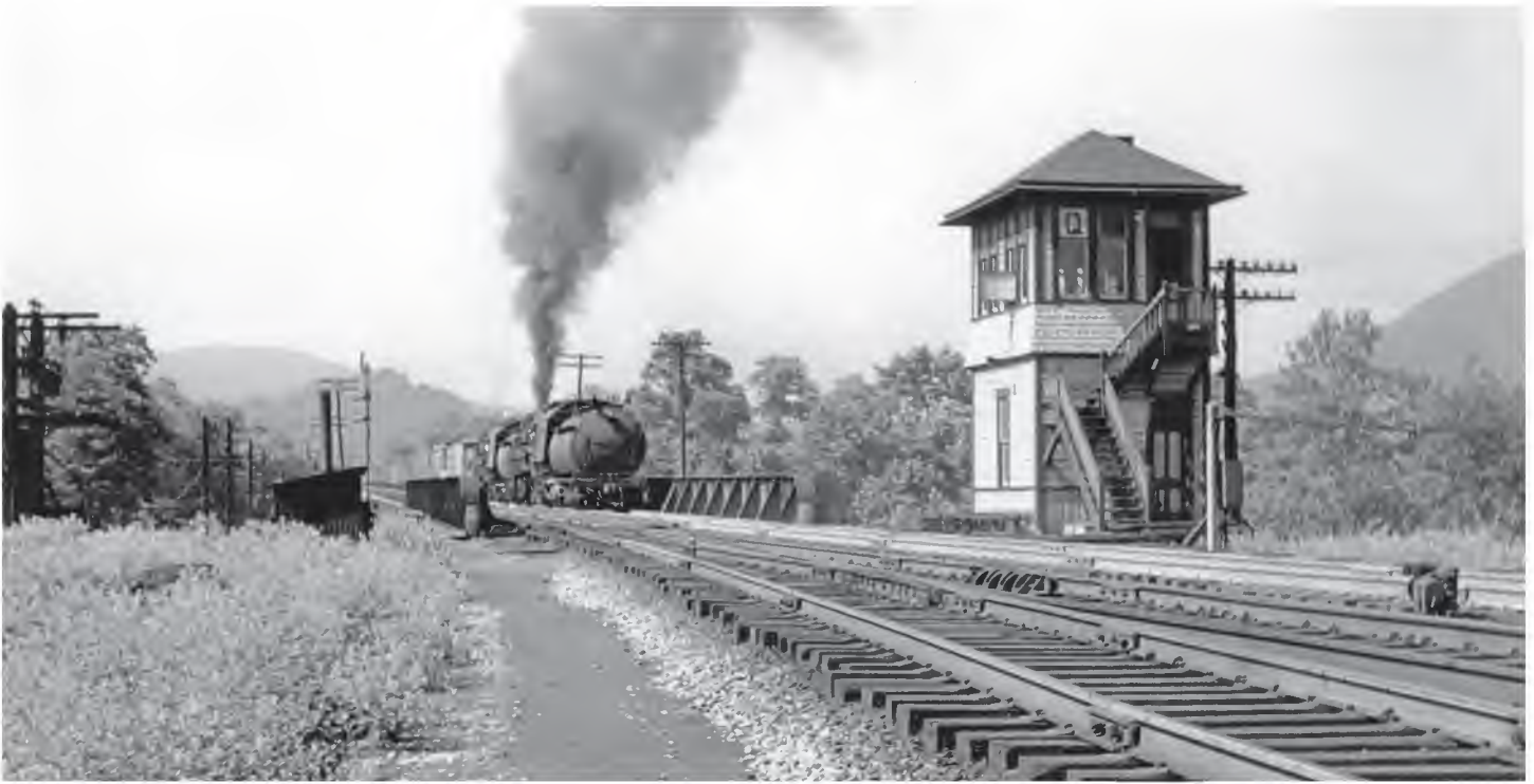
The start of Sand Patch Grade at Q Tower on the east end of Hyndman, Pennsylvania.