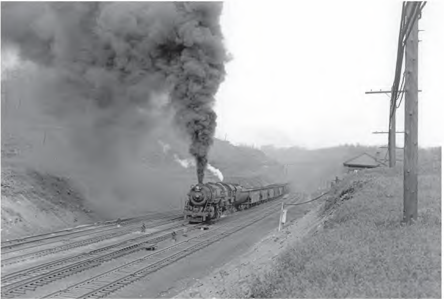
SA Tower just west of Sand Patch Tunnel, almost at the top of the grade.